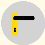
Doors/door handles Look at all reasonable opportunities to remove them