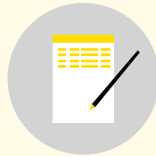
Reception and sign in areas